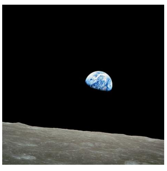
The color version, taken by William Anders, astronaut<sup>4</sup>

The human consciousness created by the Overview Effect experienced by the astronauts as they beheld earth from space was transformed into human awareness through the Earthrise and ensuing pictures. The long-term effect of this consciousness engendered the human awareness that Earth has one climatic system.